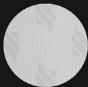
Pro Box Interlock Fabric